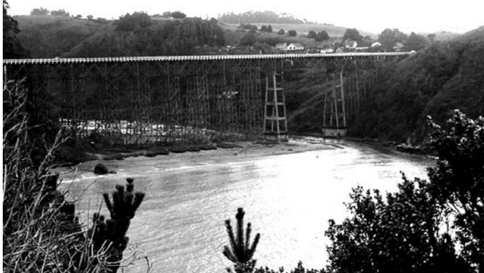
Above and above right: The Albion River Bridge is the oldest working timber-frame bridge in California. Constructed of old-growth redwood, it is still sound.